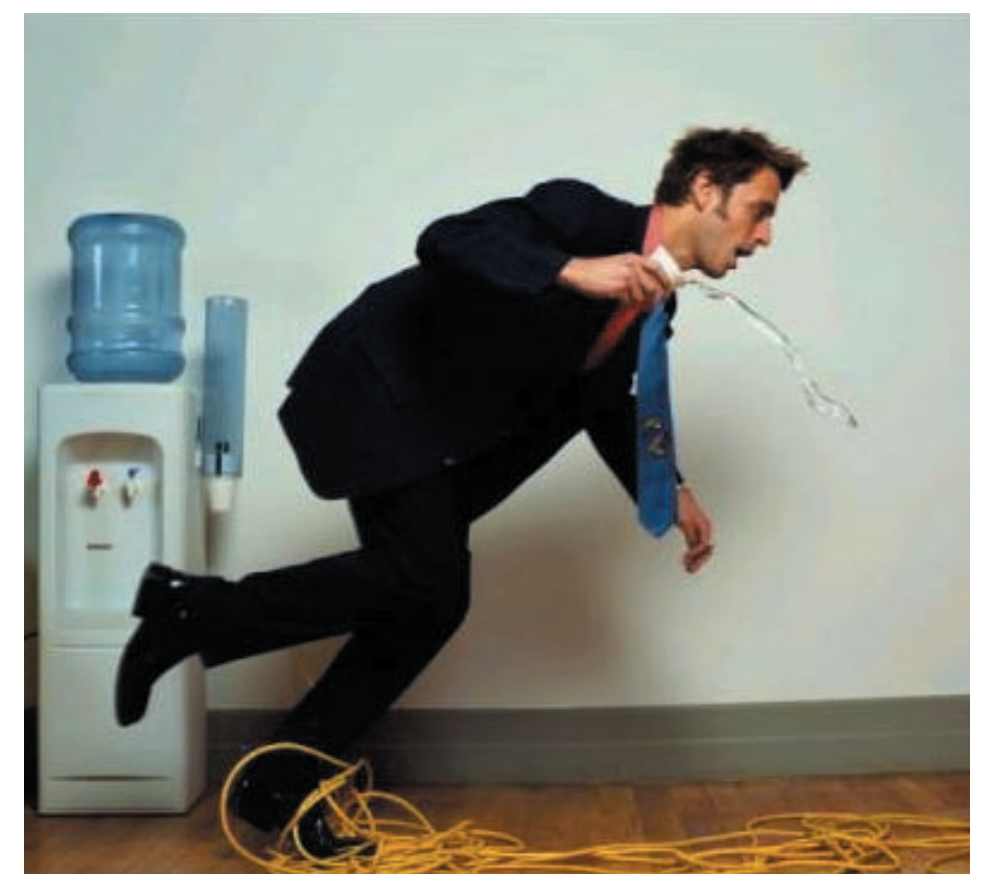
Tripping over . . .

for a prolonged period. It may then be necessary for a competent person to carry out further noise assessments to determine if further control measures are required.