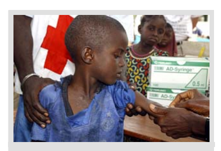
A vaccine is a special type of medicine that protects your body from a disease.

A famine happens when farmers cannot produce enough crops to feed everyone.