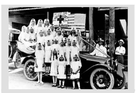
Junior Red Crossers in Texas during World War I. Today the Junior Red Cross members are called American Red Cross Youth Volunteers . Contact your Red Cross chapter to get involved.

During World War I and World War II school-aged volunteers called the Junior Red Cross helped the military by making handcrafted games and other items like knitted mufflers. Today the Red Cross Armed Forces Emergency Services (AFES) continues the tradition of providing services to U.S. forces and their families wherever they are.