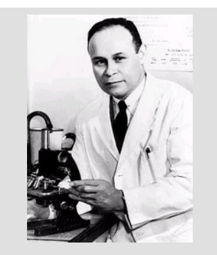
Across the country, schools bear the name of Dr. Charles R. Drew as a tribute him.

The Red Cross blood program started as a relief effort to provide lifesaving plasma and blood during World War II. The American Red Cross collects and distributes nearly half the nation's blood to hospitals.