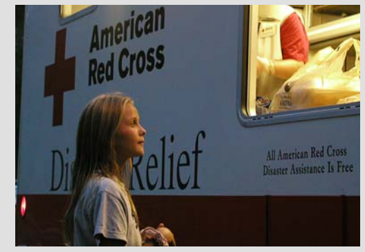
Red Cross Chapters are local offices that provide disaster relief, training and other services in communities across the United States.

The American Red Cross disaster response to the people affected by a series of hurricanes between August and October of 2005 providing emergency food, water and shelter during and after the storms—was the largest response to a natural disaster in the organization's 125 year history.